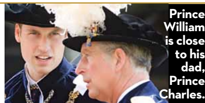
Prince William is close to his dad, Prince Charles.