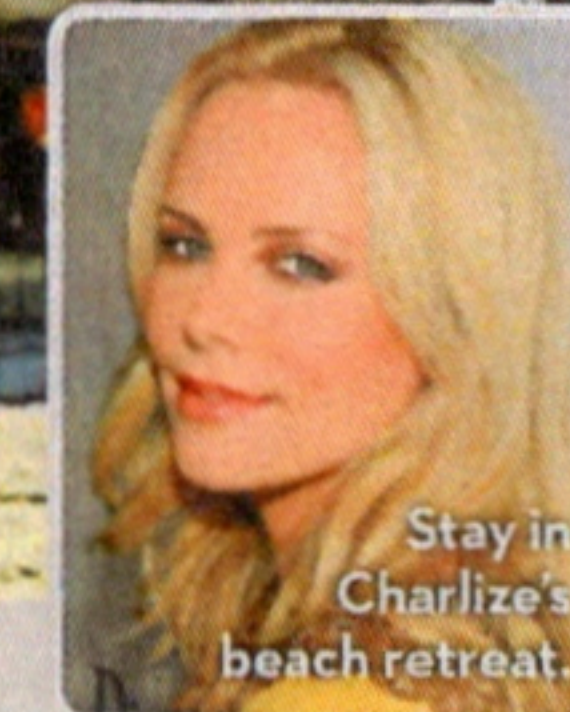
Stay in Charlize's beach retreat.

Built in 1930, it's one of the oldest homes in the area, but has been fully modernized with an open-plan dining room, large deck with a hot tub and fire pit, plus a high-tech security system.