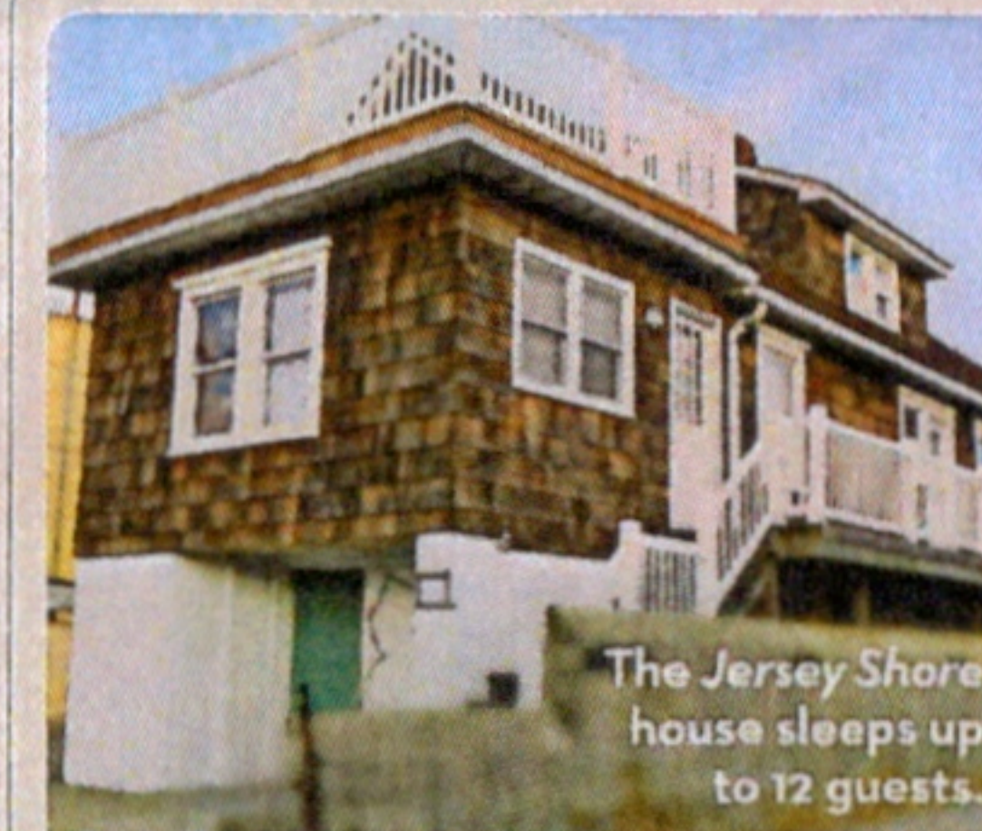
The Jersey Shore house sleeps up to 12 guests.