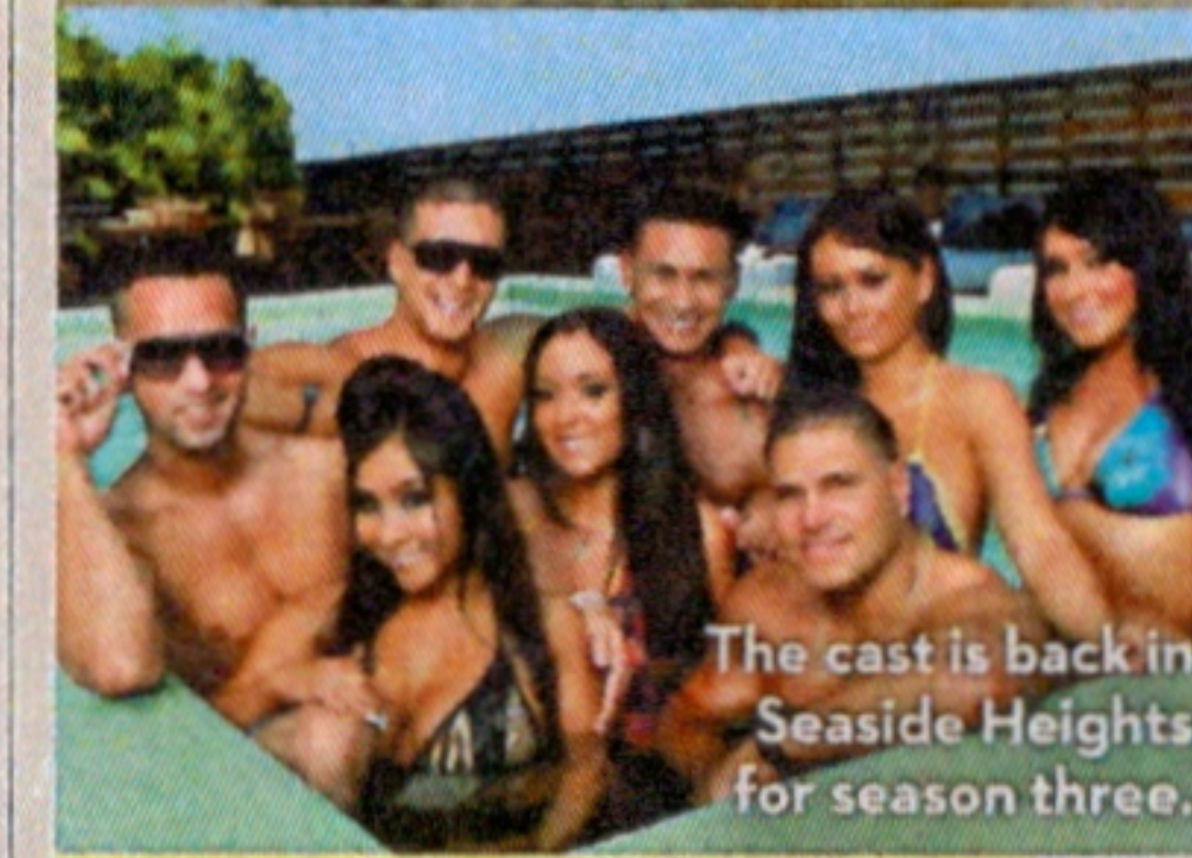
The cast is back in Seaside Heights for season three.