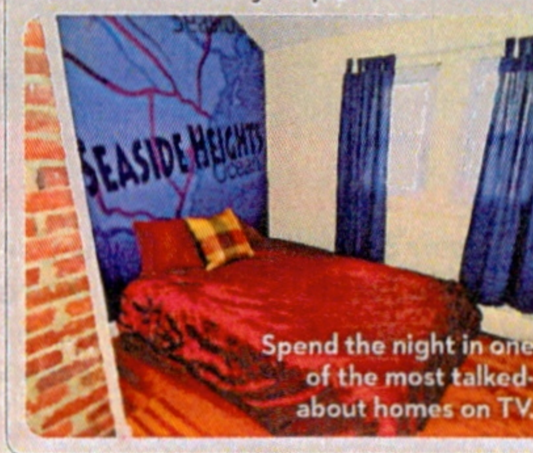
Spend the night in one of the most talked-about homes on TV.