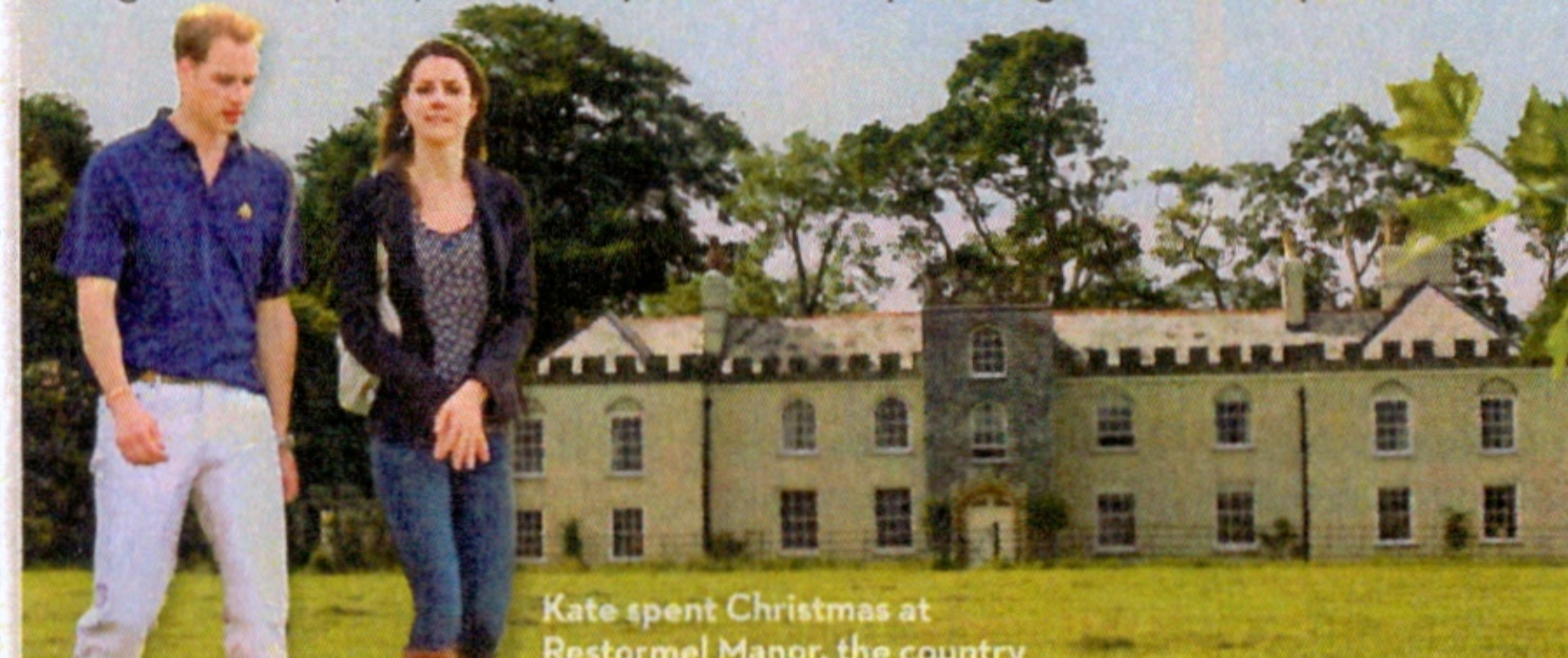
Kate spent Christmas at Restormel Manor, the country estate that Prince William is likely to inherit from his father.

Located in picturesque southwest England, a mile from the medieval town of Lostwithiel, Restormel's on-site amenities include tennis courts, a swimming pool, barbecues and acres of private gardens to explore.