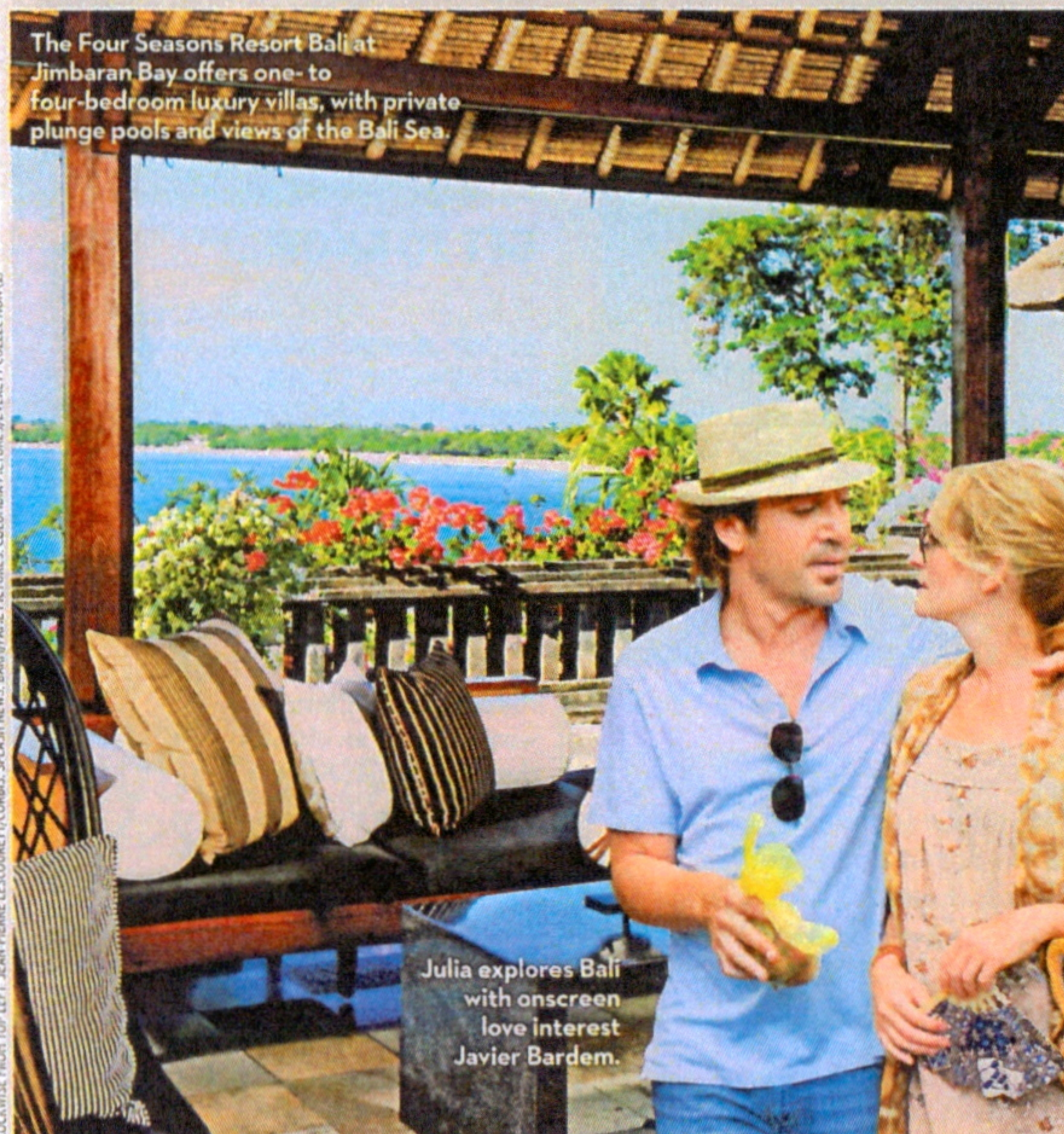
Julia explores Bali with onscreen love interest Javier Bardem.

The Four Seasons Resort Bali at Jimbaran Bay offers one- to four-bedroom luxury villas, with private plunge pools and views of the Bali Sea.