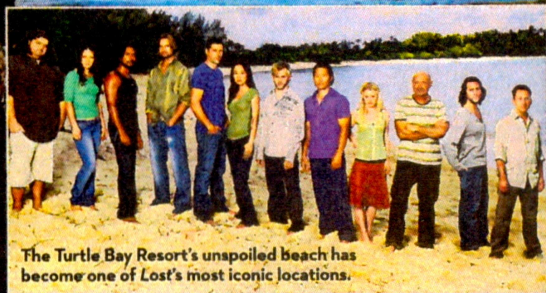
The Turtle Bay Resort's unspoiled beach has become one of Lost 's most iconic locations.

It's been six years since Lost began filming on the Hawaiian island of Oahu. Now, just weeks away from its dramatic May 23 finale, the end of Lost doesn't have to spell the end of the adventure for fans of the show. The fictional island's real-life counterpart is just a six-hour flight from L.A. Still home to a number of Lost