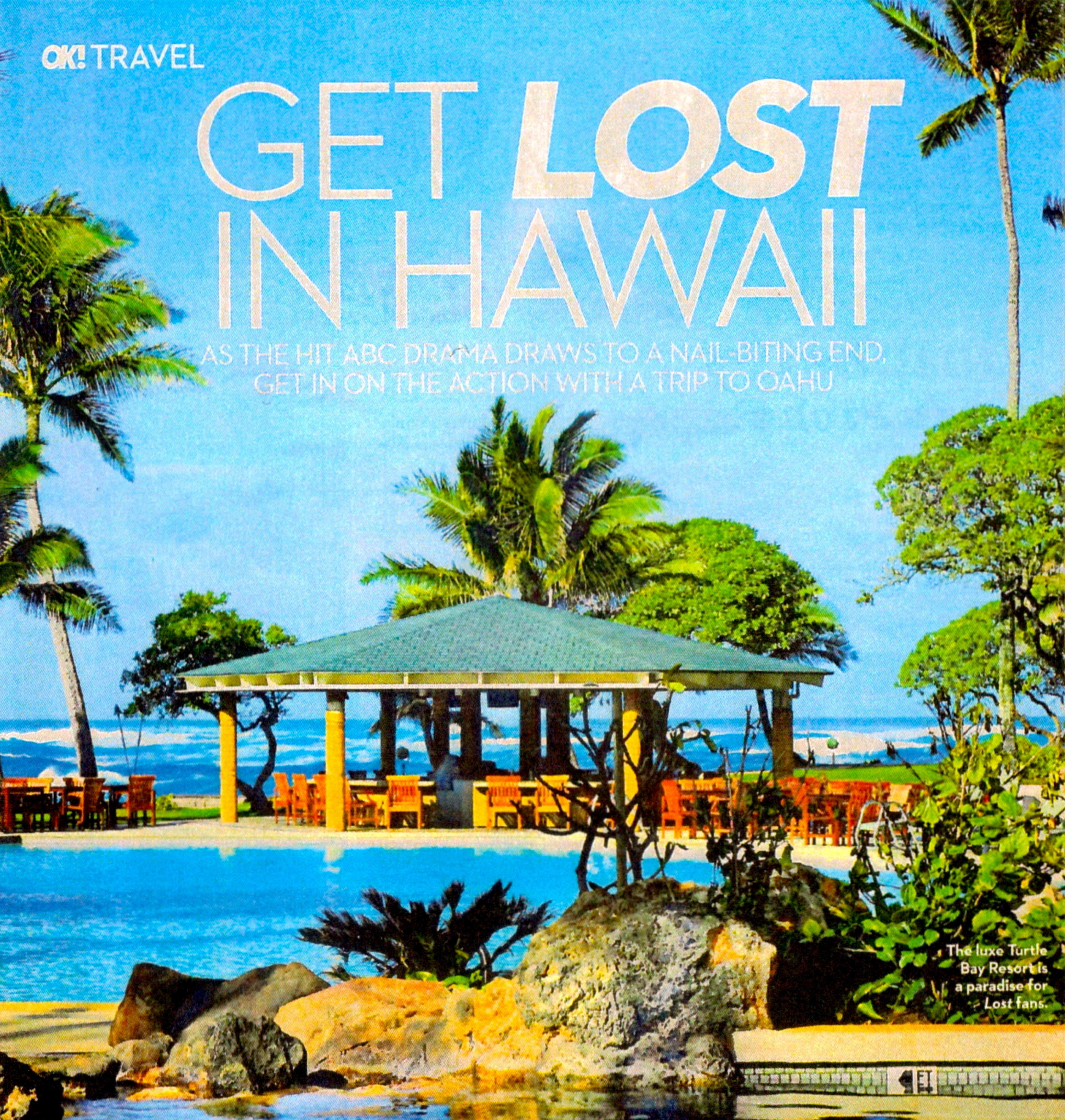
The luxe Turtle Bay Resort is a paradise for Lost fans.

AS THE HIT ABC DRAMA DRAWS TO A NAIL-BITING END, GET IN ON THE ACTION WITH A TRIP TO OAHU