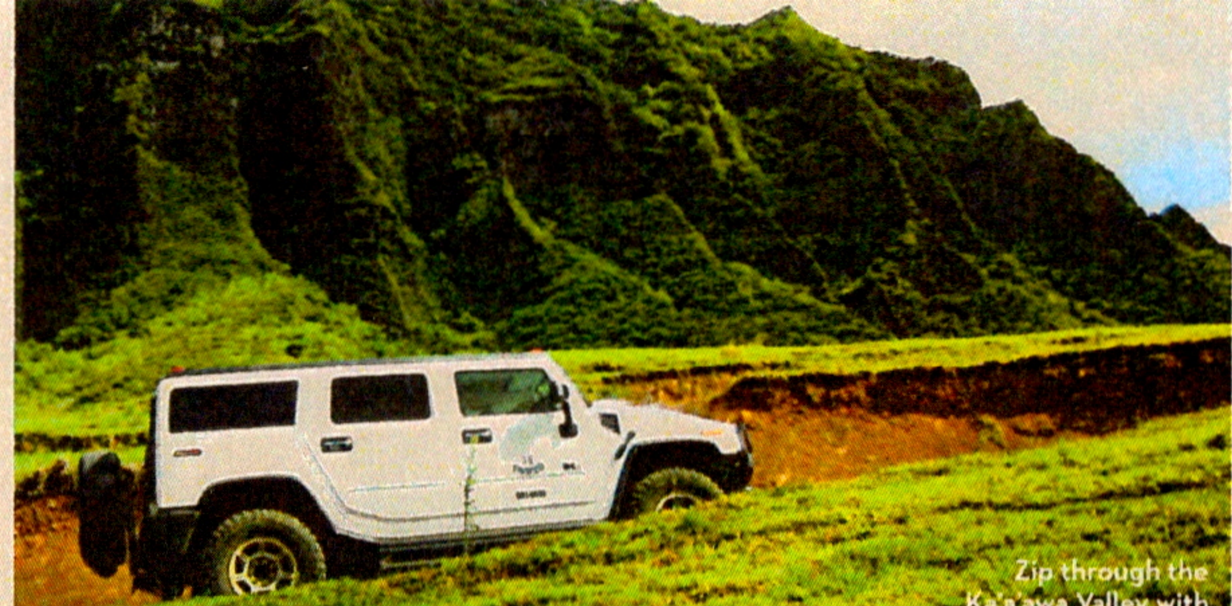
Zip through the Ka'aawa Valley with KOS Tours to see spots like Hurley's golf course (below).