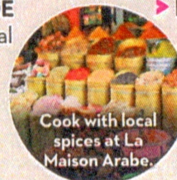
Cook with local spices at La Maison Arabe.

Sample traditional Moroccan fare in the picture-perfect garden at Dar Moha ( darmoha.ma ).