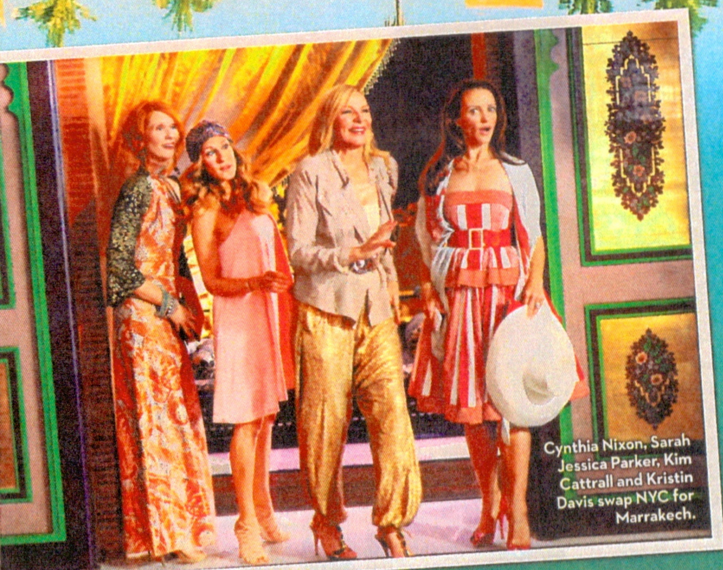
Cynthia Nixon, Sarah Jessica Parker, Kim Cattrall and Kristin Davis swap NYC for Marrakech.

The producers of Sex and the City 2 chose Marrakech, Morocco, as a perfect stand-in filming location for Abu Dhabi, United Arab Emirates. The cast and crew spent almost two months in the bustling North African metropolis, filming everywhere from the crowded markets inside the ancient walls of the Medina to the desert wilderness of the Western Sahara.