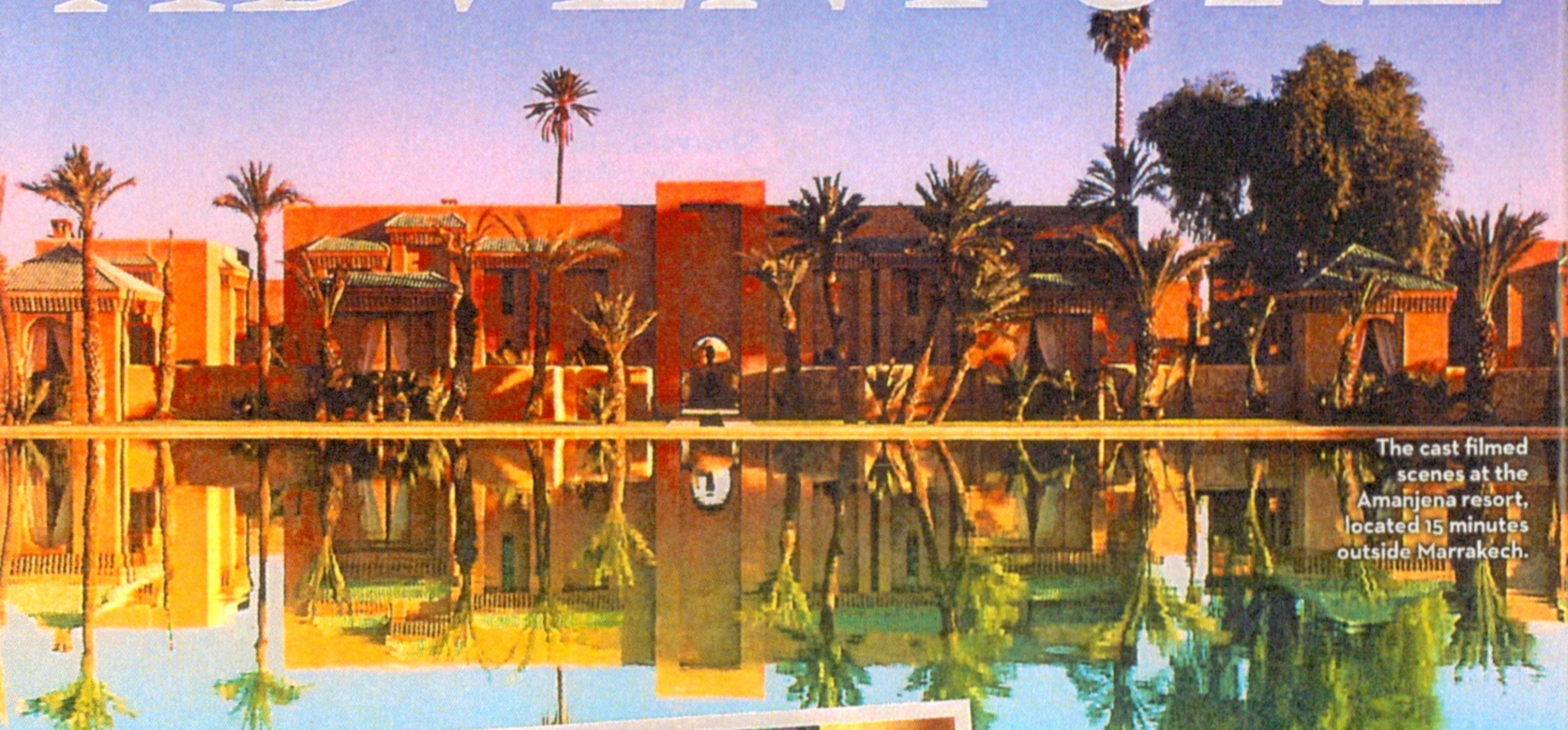
The cast filmed scenes at the Amanjena resort, located 15 minutes outside Marrakech.

The stars of Sex and the City 2 fell in love with Morocco's luxurious hotels, world-class wares and vibrant culture