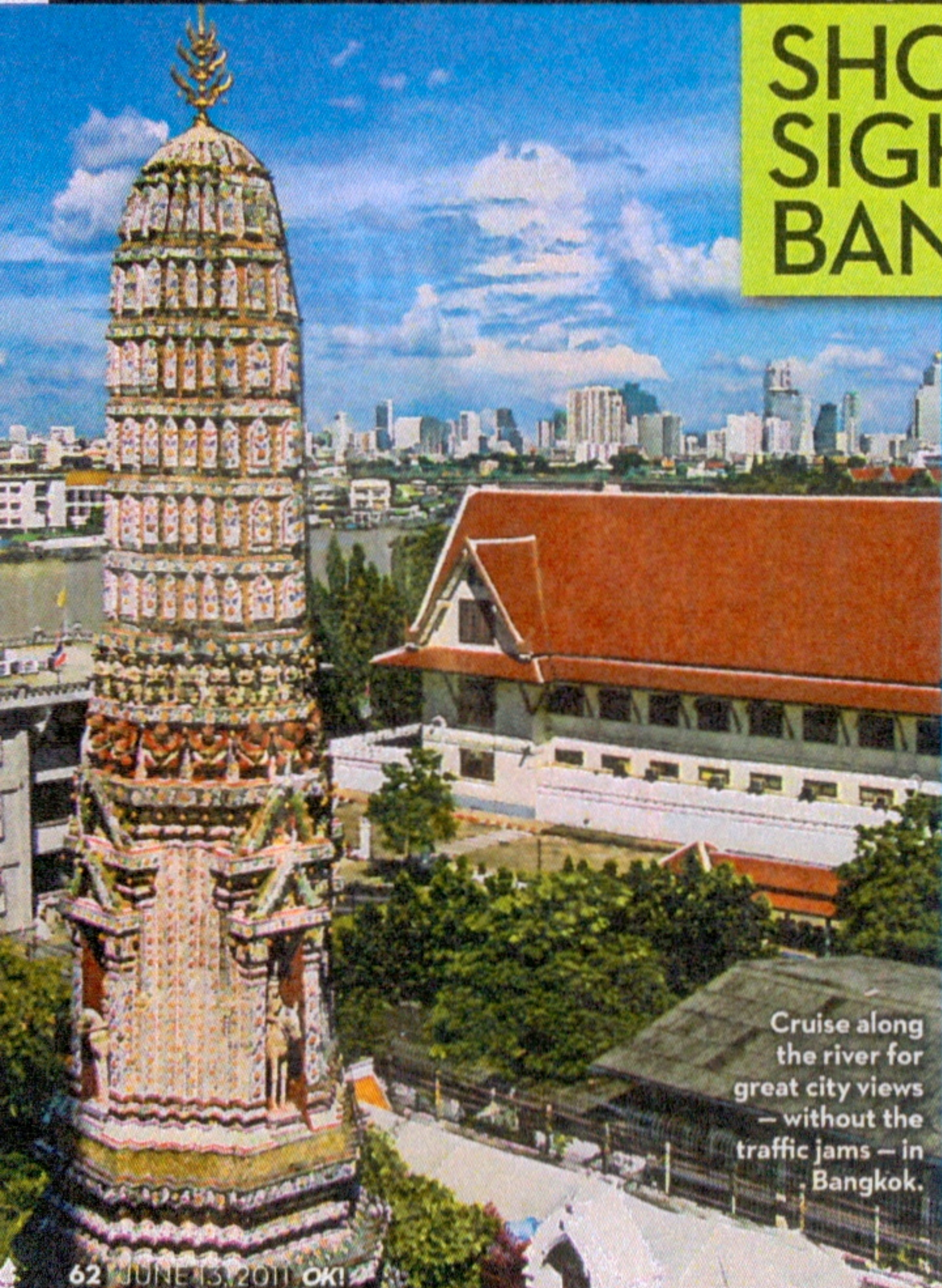
Cruise along the river for great city views — without the traffic jams — in Bangkok.

Thailand's vibrant capital, Bangkok, is the setting for the jaw-dropping action in The Hangover Part II . "It's the most un-boring place," Hangover star Zach Galifianakis told Entertainment Tonight . "I just love it."