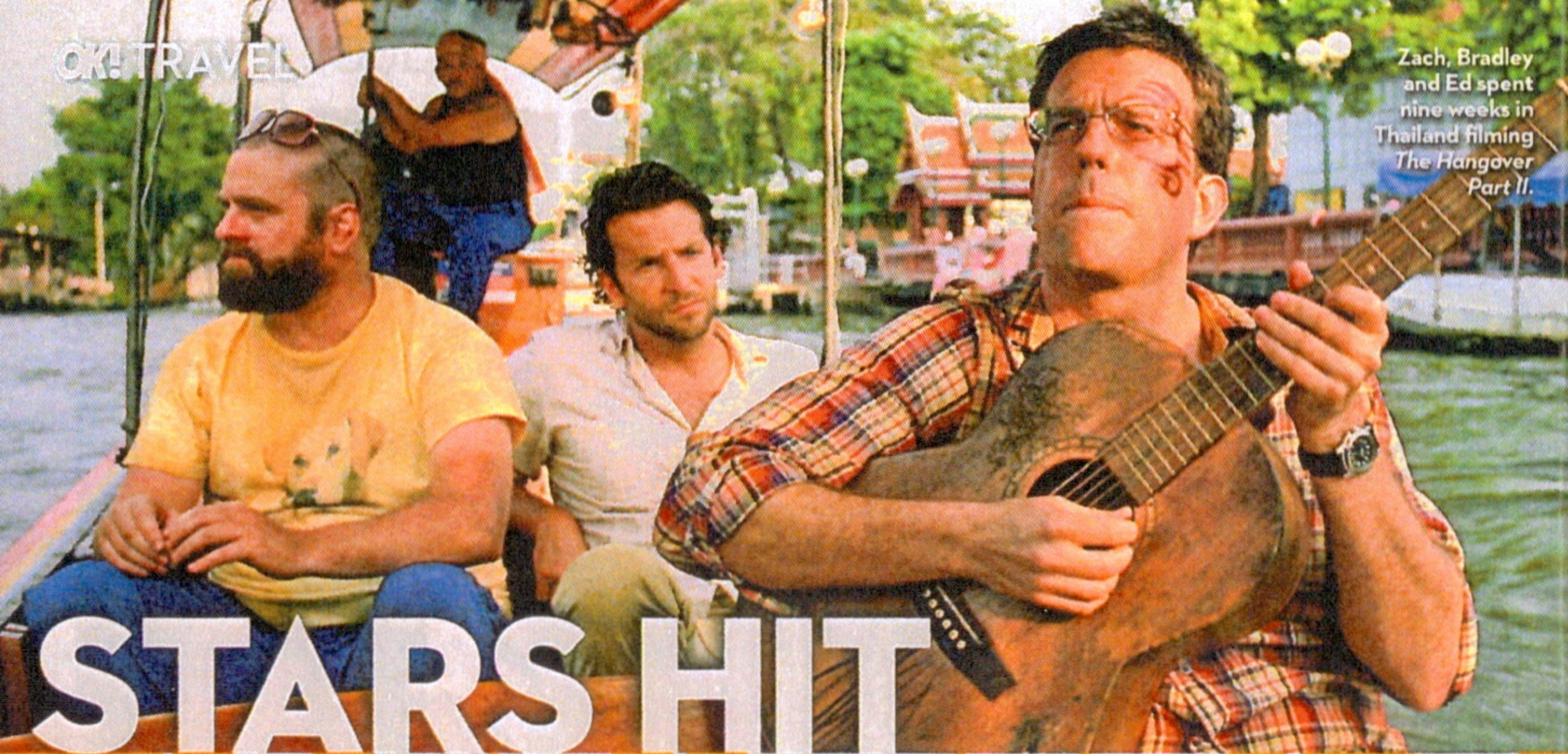
Zach, Bradley and Ed spent nine weeks in Thailand filming The Hangover Part II .